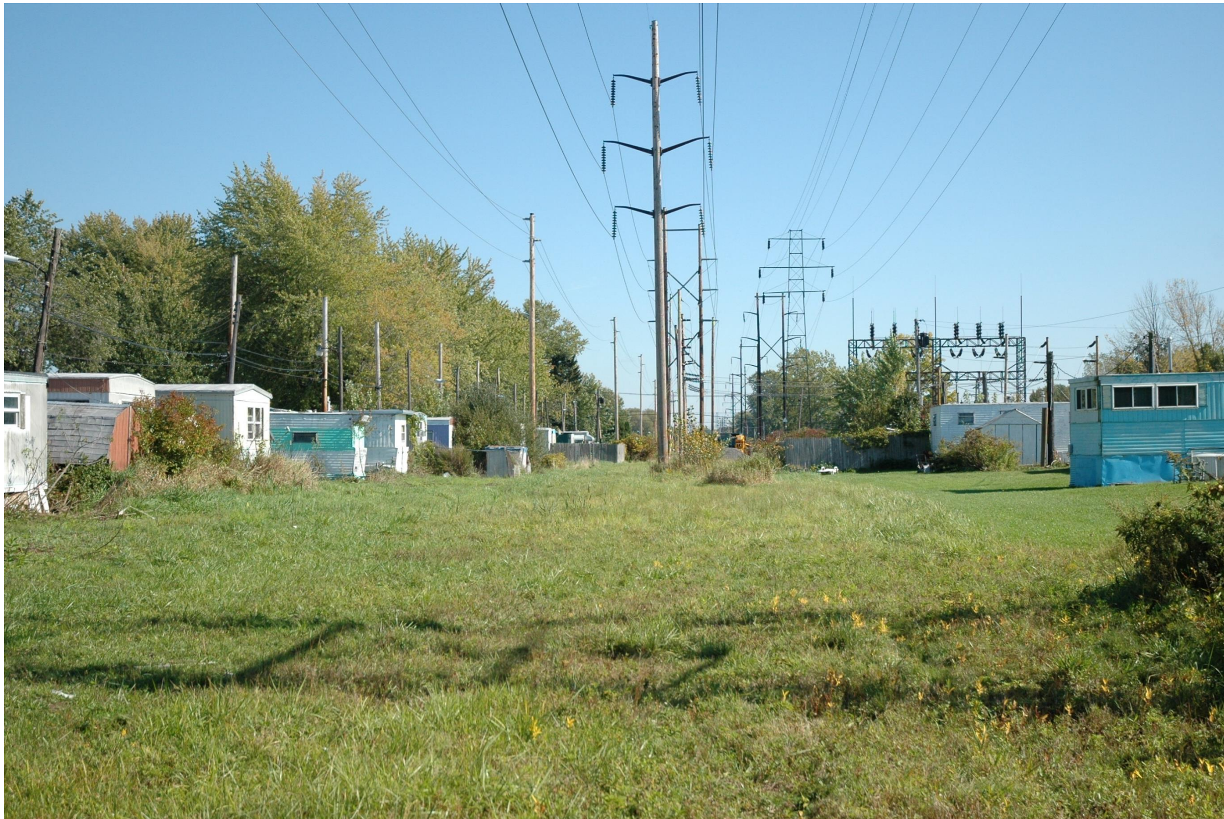
View south. Existing structure in foreground is #58